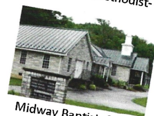
Midway Baptist- 2016