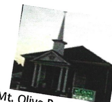
Mt. Olive Baptist- 2015