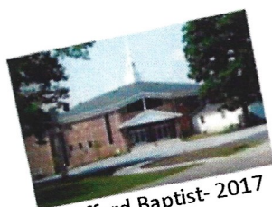
Clifford Baptist- 2017