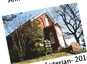
Amherst Presbyterian- 2014