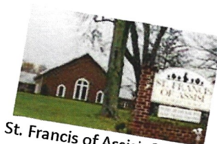
St. Francis of Assisi- 2015

Our church partners and the year they began preparing meals for us