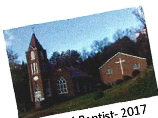
Emmanuel Baptist- 2017

Amazing things happen when a non-profit organization, Blue Ledge Meals on Wheels (MOW), has the support of eleven churches to feed those in need in Amherst County.