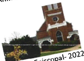
Ascension Episcopal- 2022