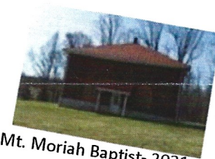
Mt. Moriah Baptist- 2021