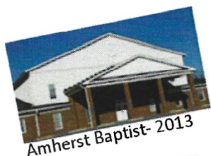
Amherst Baptist- 2013

Serving the community, one meal at a time