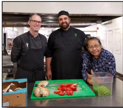
Sweet Briar College Prepares Meals for Amherst Homebound

As we enter the beautiful campus of Sweet Briar College, we are reminded how fortunate Amherst residents are to have this institution of higher educational in the area. Not only does Sweet Briar offer many opportunities and facilities for those in town and surrounding counties,